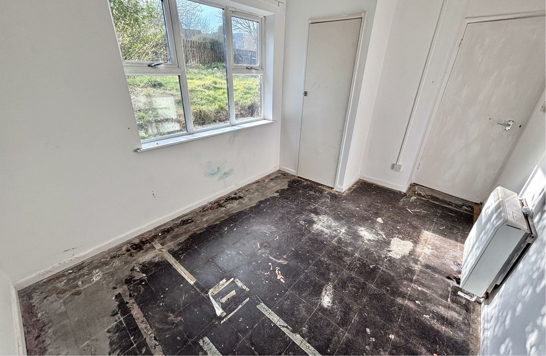
Montgomery Road, Penwithick, St. Austell, PL26 8UU